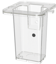
Inner Container & Plug